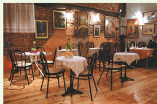
Art Gallery of Wieruszów