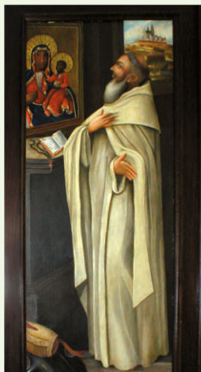
Portrait of the Father Augustyn Kordecki