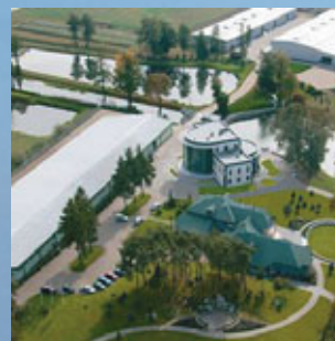
Przedsiębiorstwo Komunalne SA in Wieruszów