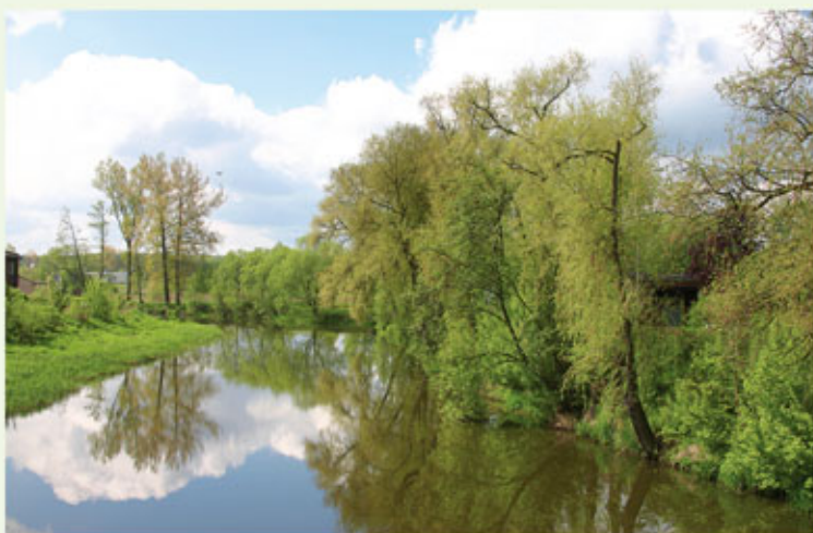
Prosna River Valley

Wieruszów Commune is situated on the Area of protected landscape „Prosna River Valley” created to preserve valuable natural areas and landscape basing on the decree of the Kalisz Voivod from 1996. It is incorporated into the ECONET system as an ecological corridor of national importance. The „Prosna River Valley” Area of Protected Landscape covers around 3,400 hectares and features unique natural landscape. It is characterised by diverse plant and forest assemblies, abundance of flora and fauna on marshy areas and unpolluted environment. Active protection of forest, non-forest and water ecosystems has been implemented on the area of protected landscape.