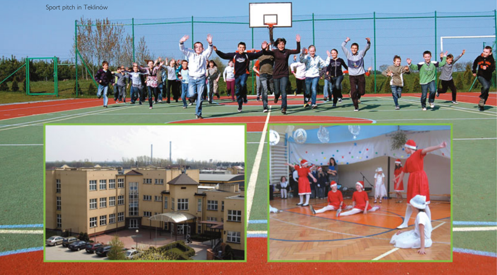
Secondary School No 1 in Wieruszów