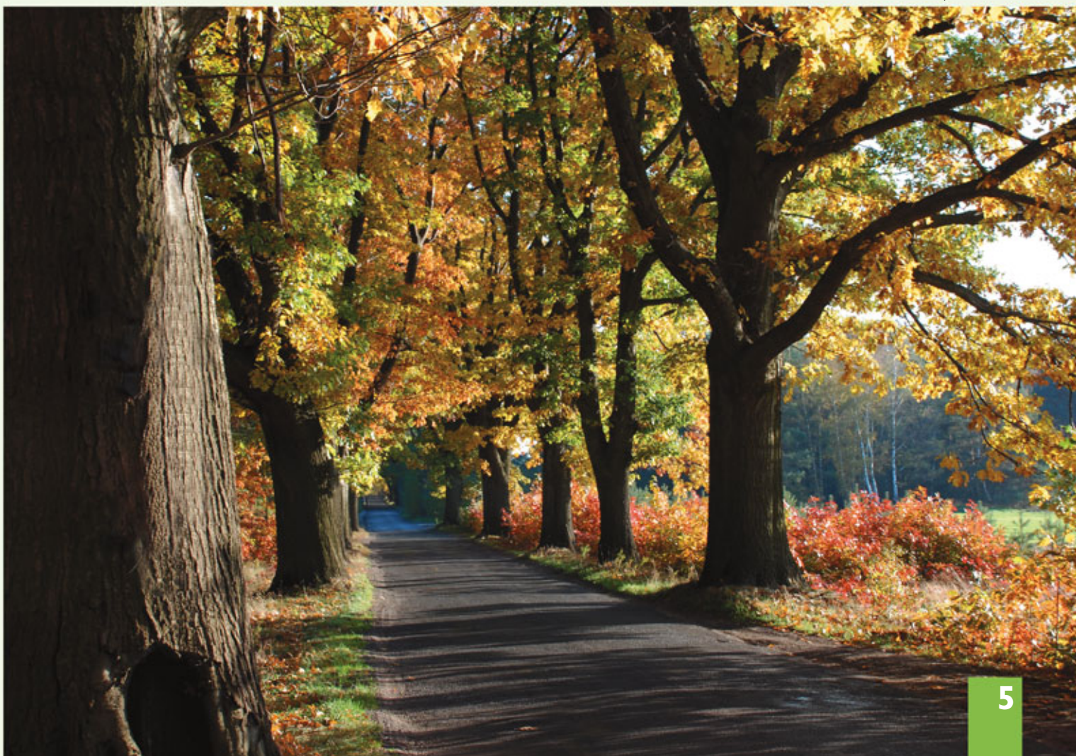
Alley of red oaks

Wieruszów Commune is situated on the Area of protected landscape „Prosna River Valley” created to preserve valuable natural areas and landscape basing on the decree of the Kalisz Voivod from 1996. It is incorporated into the ECONET system as an ecological corridor of national importance. The „Prosna River Valley” Area of Protected Landscape covers around 3,400 hectares and features unique natural landscape. It is characterised by diverse plant and forest assemblies, abundance of flora and fauna on marshy areas and unpolluted environment. Active protection of forest, non-forest and water ecosystems has been implemented on the area of protected landscape.