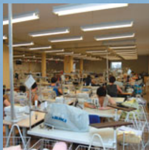
PROMAL Sp. z o.o. in Wieruszów