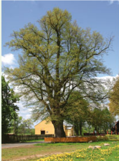
Small-leaved lime in Cieszęcín