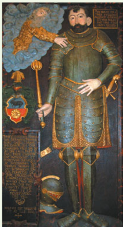
Bernard Wierusz – bas-relief from the monastery of the Paulites

As a result of the administrative reform in 1999, Wieruszów was granted a city status – the seat of the Wieruszów Powiat. Since then, many new institutes were created, such as: Tax Office, Branch of Social Security (ZUS), Branch of Farmer's Social Security (KRUS), Powiat Police Office, Powiat Fire Brigade Headquarters, Powiat Office of Agricultural Restructuring and Modernisation Agency and Powiat Sanitary and Epidemiological Station. Since that moment, a new period in development of the city and the Wieruszów Land started.