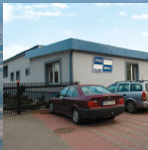
PROMAL Sp. z o.o. in Wieruszów