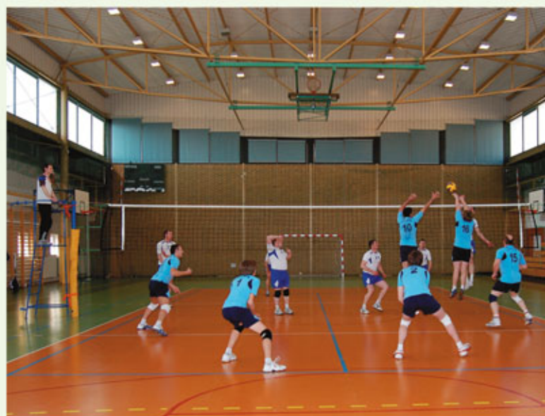
Final of the Powiat Volleyball League

functional sport pitch with polyurethane surface by the Complex of Schools No 2 in Pieczyska also started in 2009. The planned completion of the investment in the first half of 2010. School sport facilities are also well developed in the commune. The schools are equipped with sport halls and outdoor sport facilities (pitches, tennis courts etc.). We want to propagate healthy lifestyle among the youngest, therefore between 2009 and 2010 each village of the commune shall be provided with generally available playground for children.