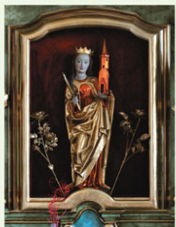
Figure of Saint Barbara in the Saint Archangel Michael church