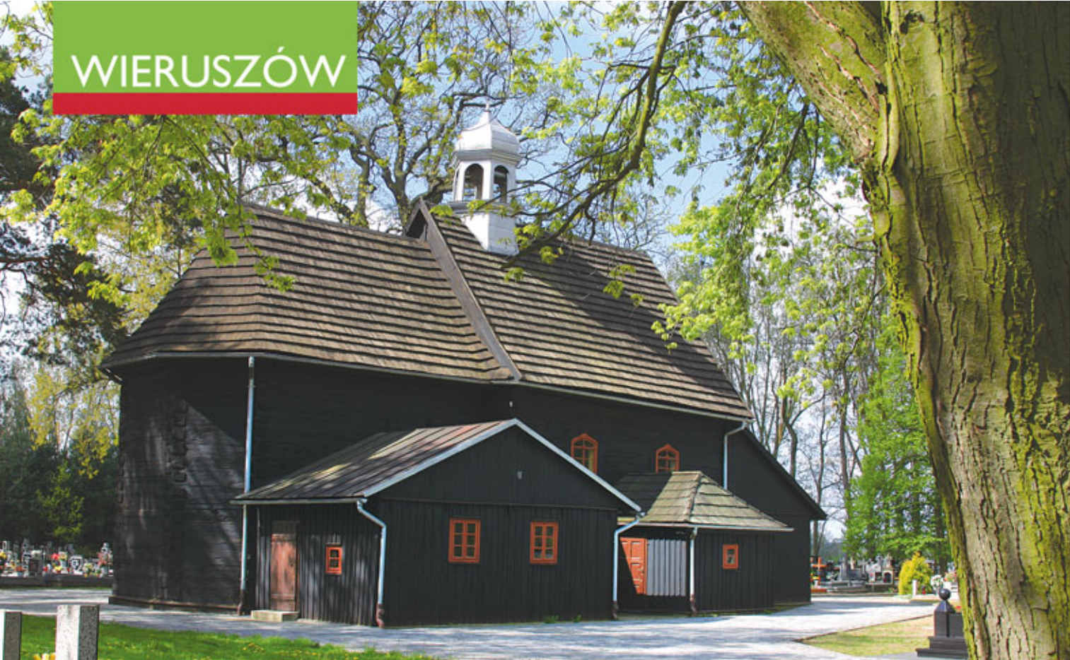
Saint Roch church in Kuźnica Skakawska