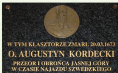
Plaque commemorating death of the Father Augustyn Kordecki in the monastery of the Paulites