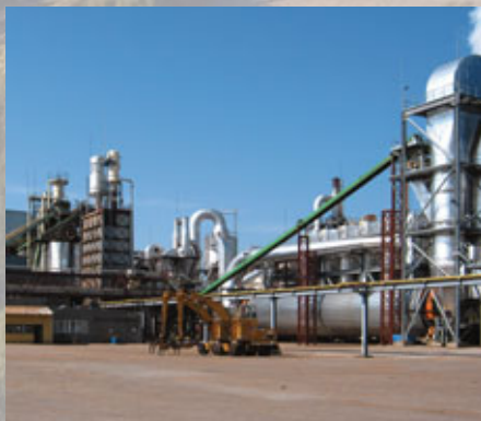
PFLEIDERER PROSPAN SA in Wieruszów

In 2008, Wieruszów Commune initiated a public aid program De Minimis for entrepreneurs investing and creating new vacancies, granting property tax exemptions, the aim of which is most of all economic development of the Commune. There are over 1,170 businesses registered on the area of the Wieruszów Commune. There are also numerous companies dealing with trade and services in the city. These are small and medium sized companies. Timber, furniture, upholstery, clothing and meat processing industries are most developed in the Wieruszów Commune and are represented by large plants known not only in Poland, but also on foreign markets, with quality certificates and marks fulfilling this way all European standards.