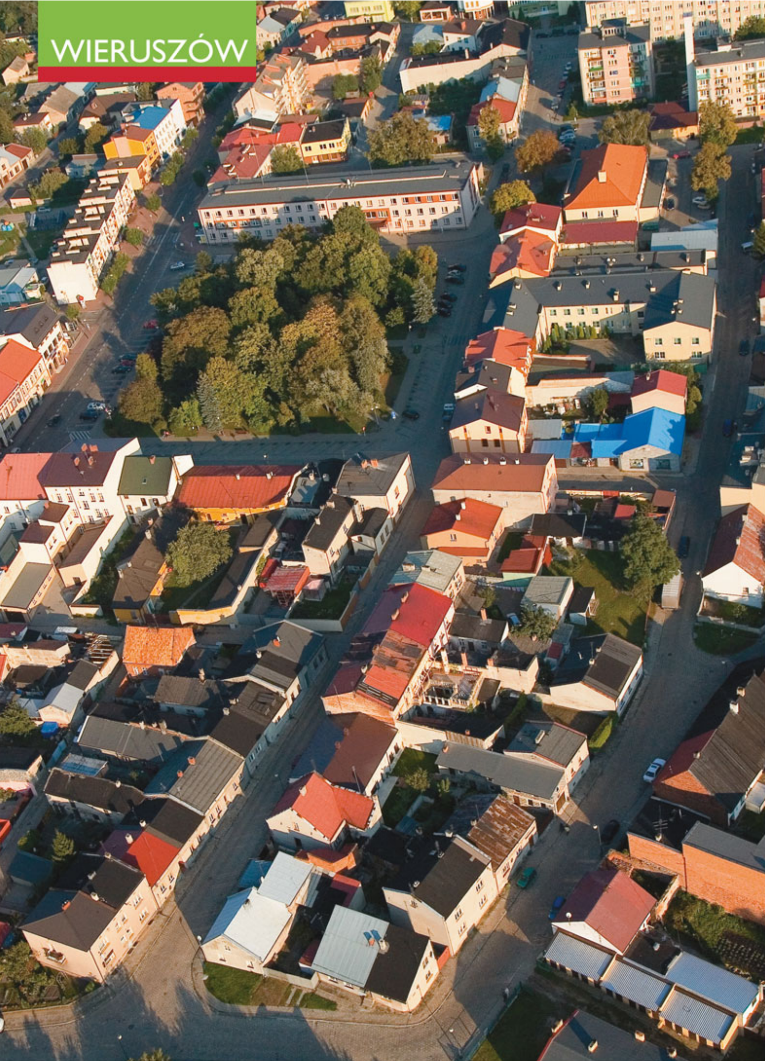
Bird's eye view of the Wieruszów Commune