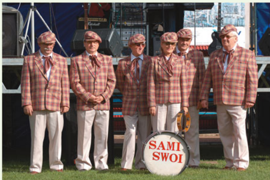
Sami Swoi Street Band

Society of Wieruszów Friends and societies of housewives cultivate cultural traditions and folk cultures cultivate folk art.