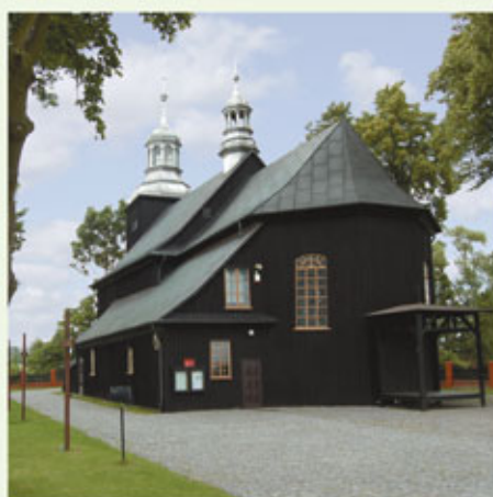
Saint Wojciech Sanctuary in Cieszęcin

Ancient amber route used to run through the Wieruszów Land. Legend says that Saint Wojciech travelled through this land over a thousand years ago on his missionary journey to Prussia and the present Saint Wojciech Sanctuary in Cieszęcin is situated on the trail of his travel.