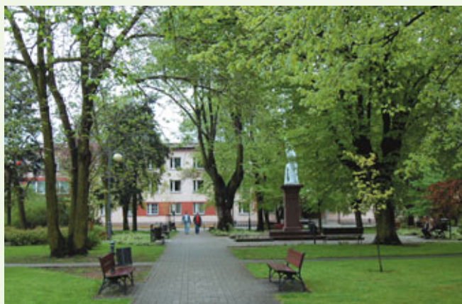
Market Square in Wieruszów