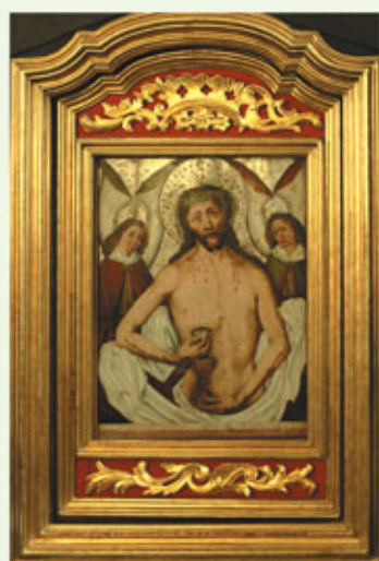
Painting of the Jesus of Five Wounds