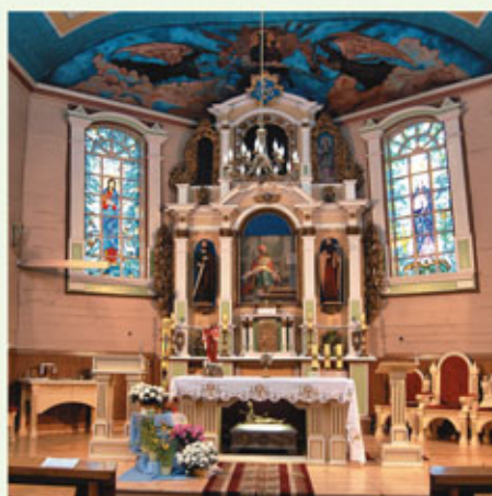
Main altar in the Saint Wojciech Sanctuary in Cieszęcin

In 1815, according to decision passed during the Vienna Congress, the border established on the River Prosna and Niesób divided the city into two parts. The western part, the so-called Podzamcze, was incorporated into the Prussian Annexation and the eastern part into the Polish Kingdom.