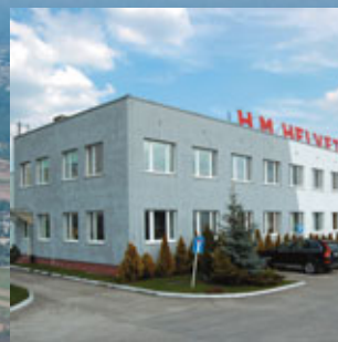
HM HELVETIA MEBLE Sp. z o.o. in Wieruszów