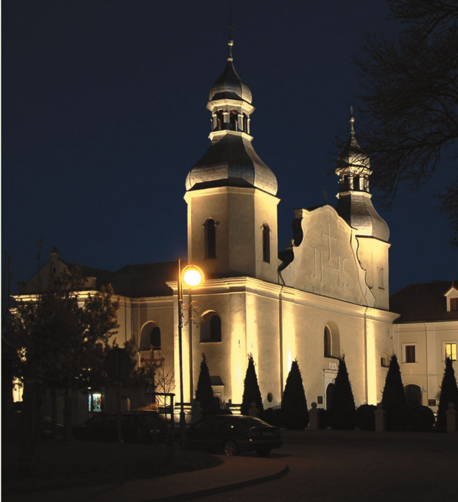
Church and monastery of the Paulites by night